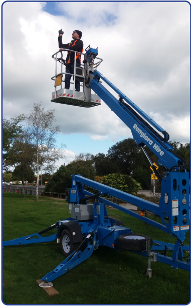
CHERRY PICKER GENIE TZ 34